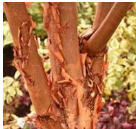
Maple – Paperbark