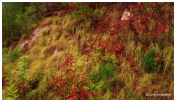
Sedge – Appalachian