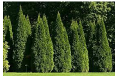
Cedar — Eastern White (Arborvitae)