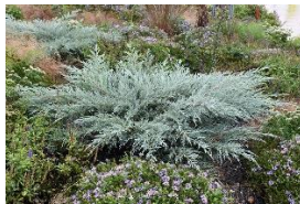
Juniper - Grey Owl