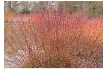
Dogwood — Silky