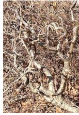
Harry Lauder's Walking Stick