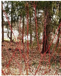
Dogwood — Red Twig