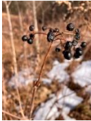
Viburnum – Mapleleaf