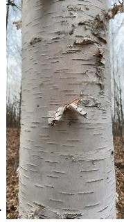
Birch — Paper