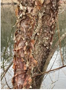
Birch — River