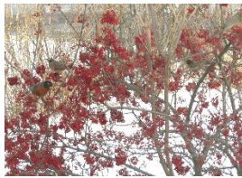
Viburnum – Cardinal Candy