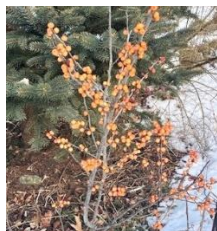
Winterberry – Coral