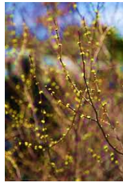
Spicebush - Northern