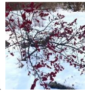
Winterberry – Red