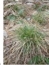
Sedge – Pennsylvania