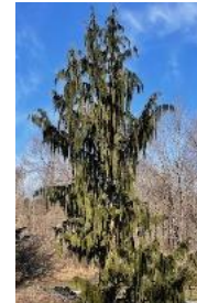
Cedar — Weeping Atlas