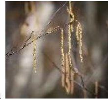
Hazelnut – American