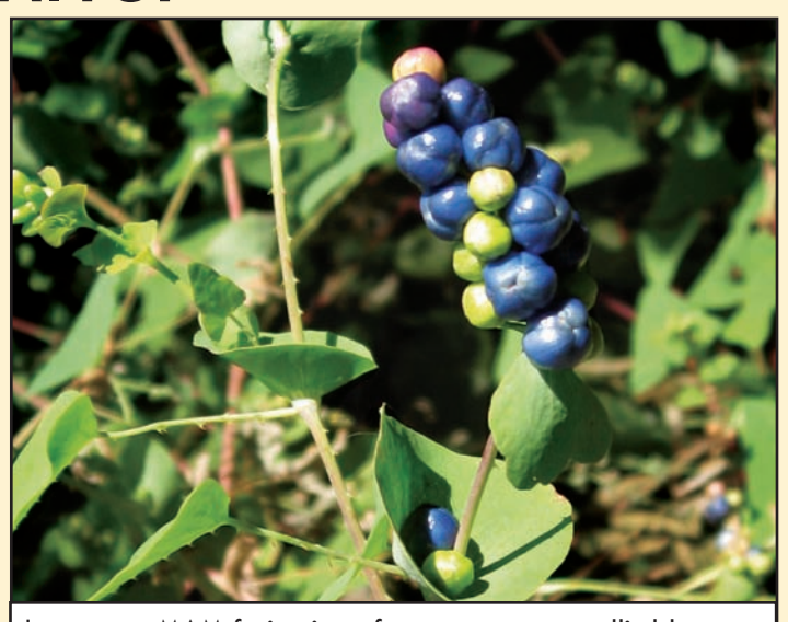
In summer, MAM fruits ripen from green to metallic blue

Leaf shapes of other vines; these species do not harm ecosystems and should not be reported: