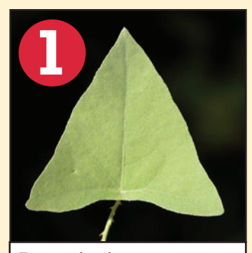
Triangular leaves (often nearly equilateral)