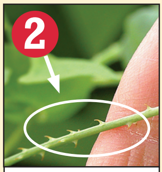
Small curved barbs along stems